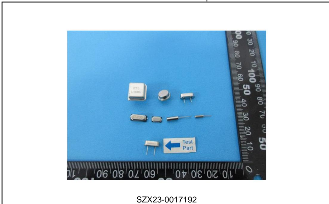
Photo of Submitted Sample

SGS authenticate the photo on original report only